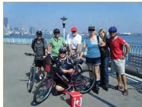
Island bike day 2012