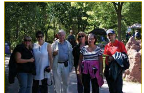
Zoo Walk 2013