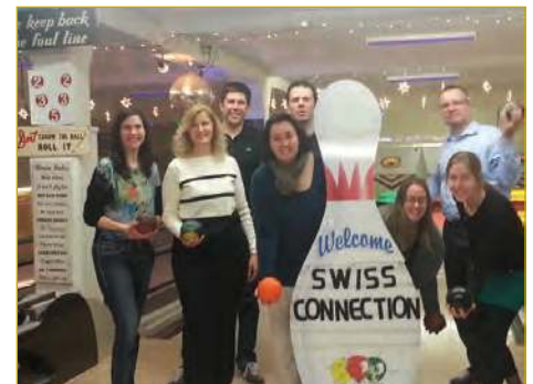
5-pin bowling 2014