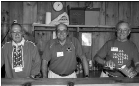
At the bar