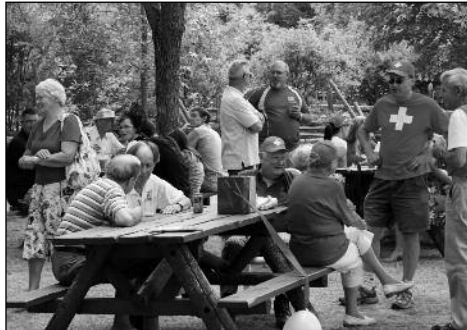
Enjoying the day with friends and family