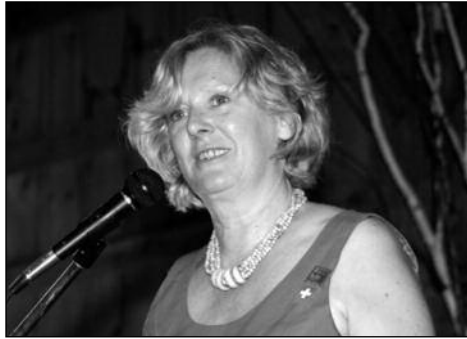
Consul General Bernadette Hunkeler-Brown