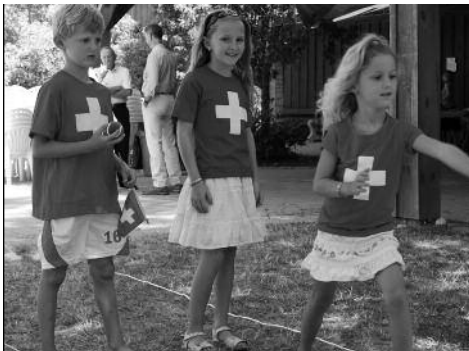
Kids playing games